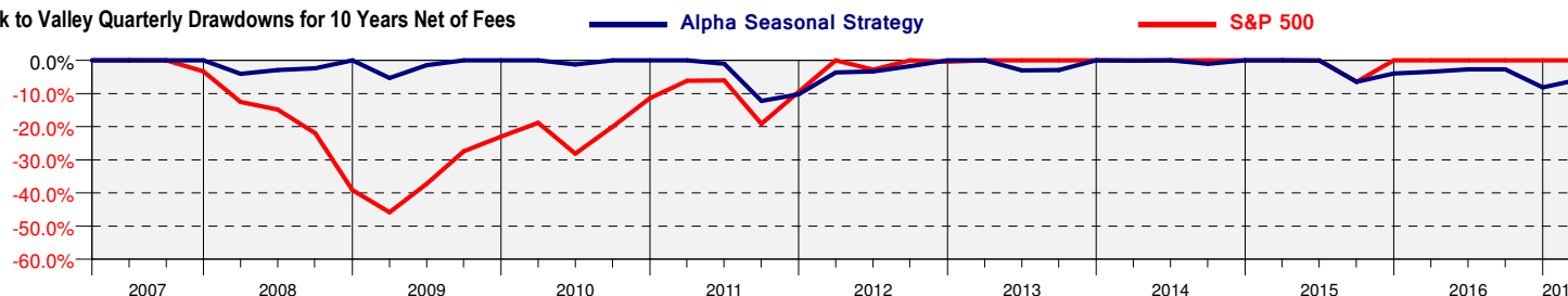
Performance Results Net of Fees